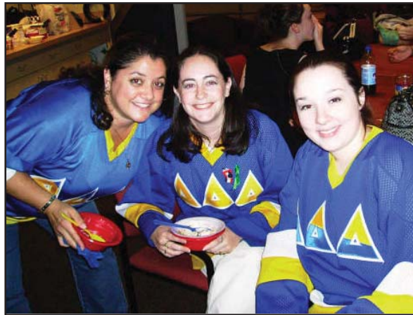
Collegiate Alumnae Ice Cream Social Mixer at Adelphi University